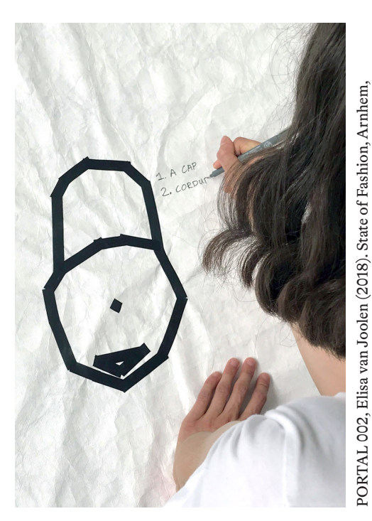
Phase 1: Gathering the research objects

Visitors entering the exhibition space were invited to participate in the research by volunteering an item of clothing worn by them that day and answering some questions about it. If they accepted the invitation, visitors were asked to take off the garment in question and to lay it down on a crispy white sheet of Tyvek covering the museum floor. Next, they were asked to trace around the item's edges with black tape, creating an abstract imprint before putting their garment back on again. Over time, more items of clothing were added. Socks, sweaters, t-shirts, scarfs, shoes, belts, and the occasional bra, transformed the white floor into a landscape of black contours; remnants of their owner's presence, like the outlines of bodies at a multiple-crime scene.