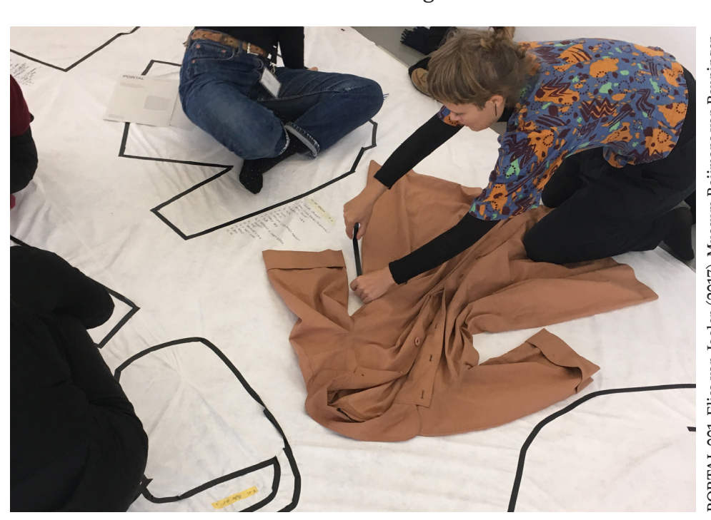
PORTAL 001, Elisa van Joolen (2017). Museum Boijmans van Beuningen, Rotterdam, The Netherlands.

Interpretations of the data were published in a booklet. This contained texts exploring, for instance, the different—monetary, emotional, social—values people attached to their garment in relation to their age, how frequently they wore the item, or when and where it was bought. Indexes and diagrams support the texts; some are pretty straight forward, mimicking the traditional bar graph or pie chart, others are more of a visual experiment, creating a whole new image to be decoded.