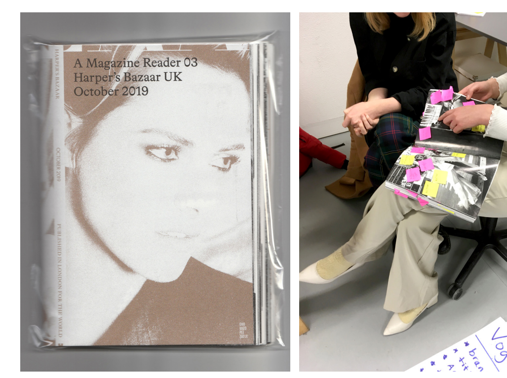
A Magazine Reader 03 and A Magazine Reader 02 workshop.

Each workshop involves the active support of a graphic designer<sup>5</sup> who provides general and individual advice in order to produce a cohesive publication. Making use of independent risograph workshops, they explain the printing process and involve participants in a hands-on way in the physical production process of the zine. Immediacy of outcome and low-threshold access dissolve barriers between content (dream) producers and manufacturing of the product, while encouraging cross-disciplinary collaboration among independent practitioners. During the workshop, informal groups were formed for different aspects of the zines' production, according to participants' strengths and interests, while budget and production decisions were taken collectively. This grassroots democratic approach, strikingly different to fashion's usual decision-making hierarchies, translated into collectively negotiating space for individual contributions, an active back-and-forth towards developing a common visual identity and intensified discussions.