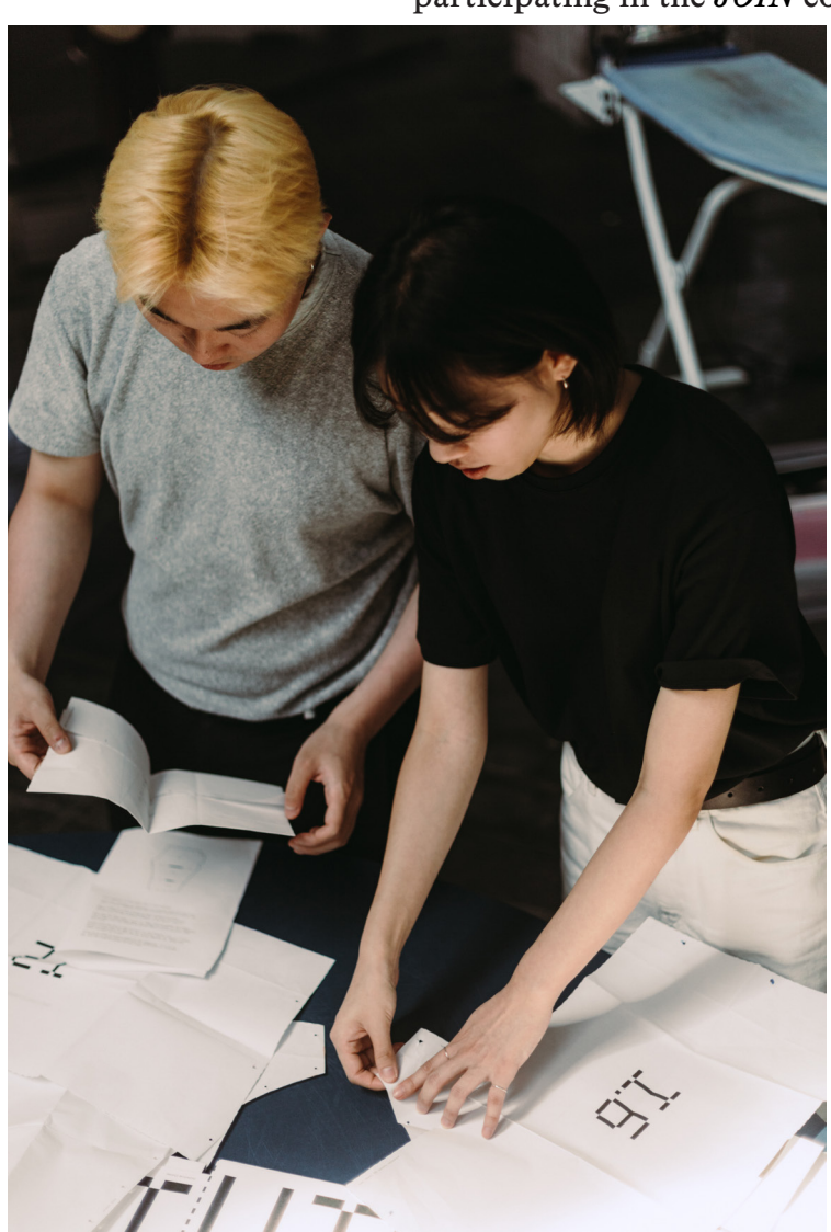
JOIN workshop at Museum Arnhem - De Kerk, Arnhem, NL (2019).

Where individual independence has increasingly been the ideal under neoliberalist capitalism of the Global North, dependency in other places and cultures is perceived as enmeshed with a sense of belonging and reciprocity of other economic systems and traditions, such as gift economies. That dependency is not a hindrance for a sense of individual freedom of expression, but perhaps instead opens up another form of freedom through relational personhood, <sup>15</sup> which can be experienced first-hand through participating in the JOIN collective work.